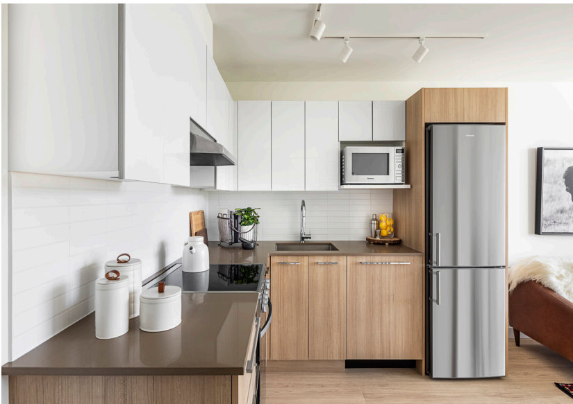
Above: 1108 Pendrell, rental building

To learn more about how the BOSAEquity™ works, or to find BlueSky and Bosa Properties rental opportunities in the Vancouver and Victoria areas, check out Bosa4Rent.com